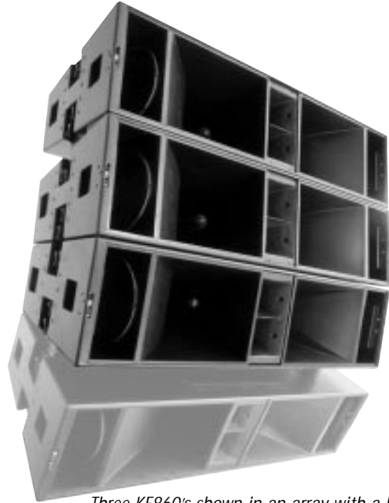
Three KF860's shown in an array with a KF861.